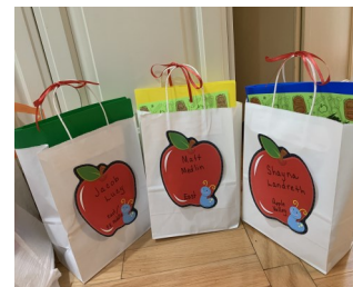
BT goody bags

In September, beginning teachers in Henderson County received goody bags to help them get started in their teaching careers. Principals took the goodies to their educators due to campuses being closed to nonessential people.