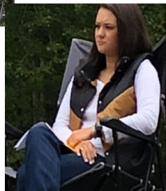
A new teacher