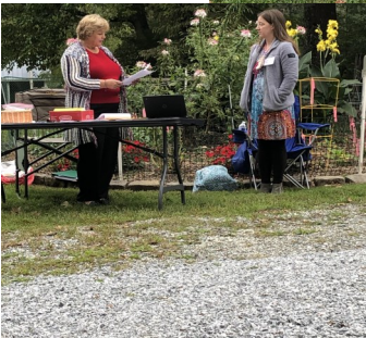
A new secretary