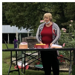
A new president